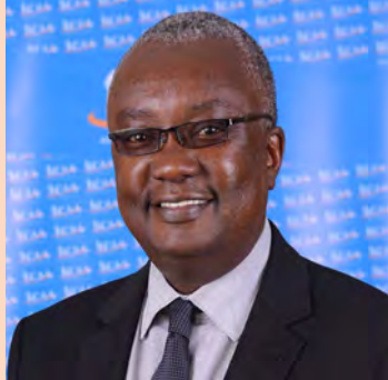
Opening keynote address by Gilbert Kibe - DG Kenya CAA