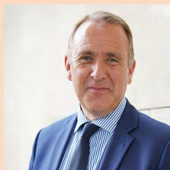
Opening keynote address by Simon Hocquard - DG CANSO